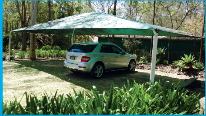
"15 Year old Z16 fabric conquers the harsh Queensland climate, installed in the Brisbane suburb of Capalaba".

Rainbow Shade submitted fabric samples to two independent accredited testing agencies. Breaking force, tear resistance and UV protection tests were conducted. The results which came back from the 15 year old fabric testing are remarkable.